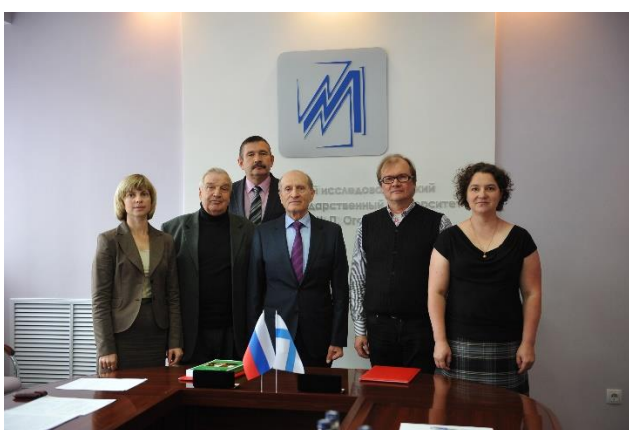
Photo: Runosong Academy has implemented many expeditions in the last years. One was in Hanti-Mansisk, Surgut area, Russkinskaya village (left) in 2014. It has also formal agreements with many institutes, like Mordvia State University (right).

In summer, some groups from Udmurtia and Karelia visit Kuhmo, Sommelo festival. In autumn, the preparation continues, and the program in details is ensured.